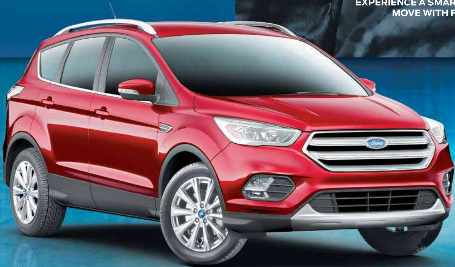
2018 ESCAPE TITANIUM

EXPERIENCE A SMARTER WAY TO MOVE WITH FORDPASS™†