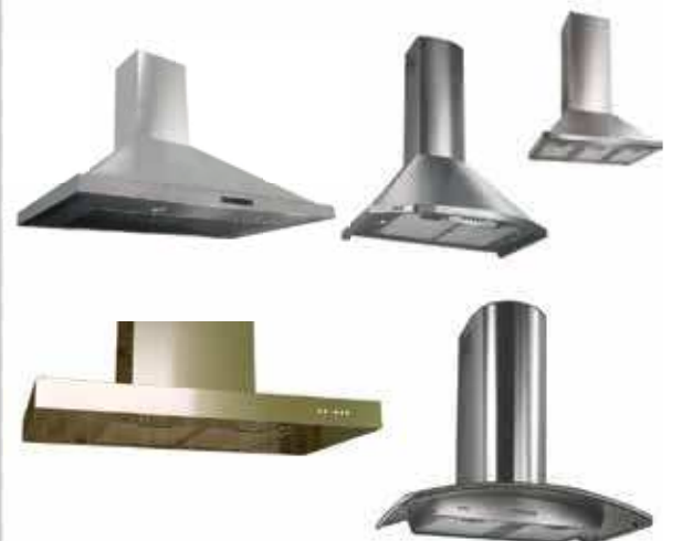
NEW ~ Eklos Canopy -- Chimney Hoods -- Power Packs

All Euro styles > instant discount -$100 + free $165 heater fan