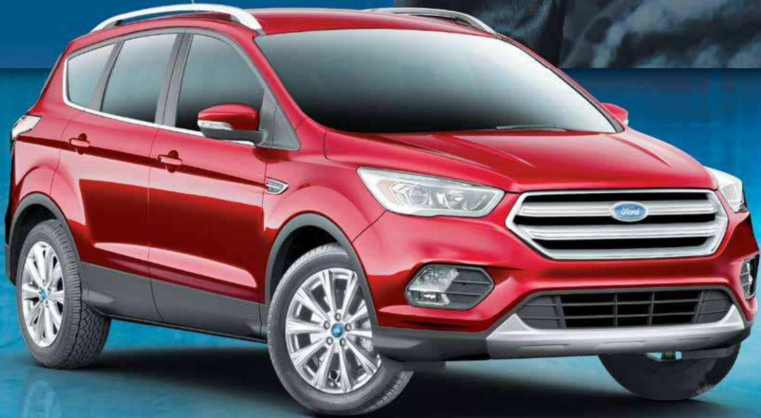
2018 ESCAPE TITANIUM

EXPERIENCE A SMARTER WAY TO MOVE WITH FORDPASS™†