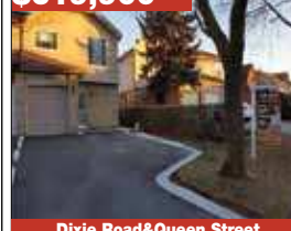
Dixie Road&Queen Street

4-Bedroom Home In High Demand Area. Home Is Situated On A Deep 140 Ft Lot On Maturetree Lined, Child-Friendly Cres. Fabulous Floor Plan Includes Eat-In Country Kitchen, Large Principle Rooms On Main Level, Almost Everything Up-Dated Thru-Out Years Includes Vinyl Siding, Eaves, Soffits, Windows, Exterior Doors, Custom Over-Sized Backyard Sliding Door.