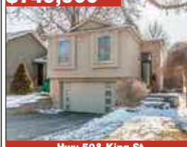
Hwy 50& King St

Beautiful Detached Raised Bungalow In Very High Demand Area. Newly Renovated With Thousands Of Dollars Spent On Upgrades. Front Stone & Stucco (2017), New Driveway (2017), New Kitchen With Granite Counter Tops (2014), Fully Renovated Washrooms With Marble Tiles (2017), New Floor, New Roof (2009), High-Efficiency Furnace.