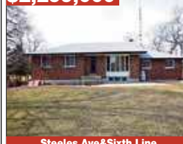
Steeles Ave&Sixth Line

Attention Investors!! A Rare Opportunity To Own A Future Development 3.85 Acre Of Parcel Of Land, Just North Of Steeles Ave. A Rare Find, 400FT Front On The Sixth Line. A Custom Built 3 Bedroom Bungalow, Large Eat-In Kitchen, Hardwood Floors, Well Kept And Recently Upgraded. Tree Lined Paved Driveway With Lots Of Parking. Minutes From Hwy.