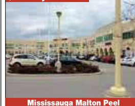
Mississauga Malton Peel

16-Years And Running Pizza Store, Grab-A-Pizza For Sale For The First Time In The Malton Community Located At The Busy Great Punjab Plaza. It Is A Turn Key Business Ready To Go. A Lot Of Goodwill And Business Attached To This Pizza Store And Comes With All The Equipment Including Double Pizza Oven, 2 Grills 2 Deep Fryers More!