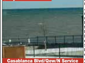
Casablanca Blvd/Qew/N Service

Brand New Brant Haven Lake House Condo With Unobstructed Waterfront And Pool View! 2 Bedroom And 2 Full Bathrooms. Upgraded Kitchen W/Quartz Counters With Upgraded Island, Breakfast Bar, Extended Upper Cabinets, Ceramic Back Splash, Walkout To Large Wraparound Balcony With The Most Amazing View Of Lake Ontario. 1 Parking.