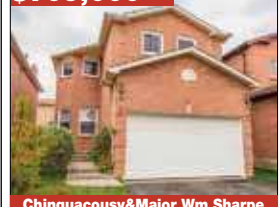
Chinguacousy&Major Wm Sharpe

Spacious 4 Bedroom Detached Home In Desirable Area. Close To All Amenities. Good Size Eat-In Kitchen W/Walkout To Deck & Backyard. Lots Of Pot Lights In Kitchen And Family Room. Wood Fireplace. New Carpets On Stairs & 2nd Floor. Master Bdrm Boasts A Jacuzzi With Po Ensuite&Hardwood. Partly Finished Basement With Kitchen And Living Area.